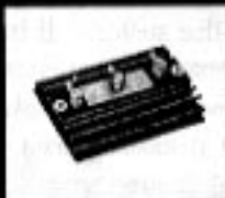
DUAL BATTERY ISOLATOR