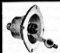
PRESSURE REGULATED WATER ENTRY